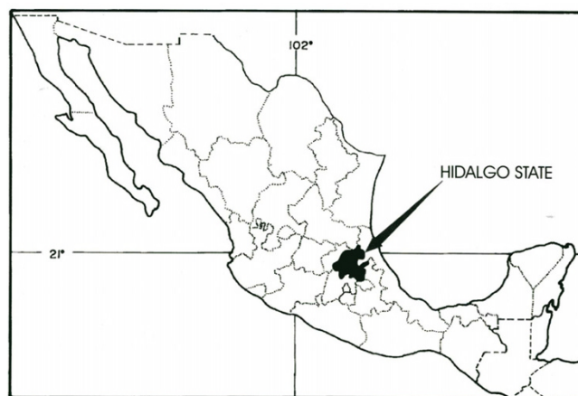
Figure 2 Geography situation of Hidalgo State in Mexican Republic.

Tulancingo, Hidalgo is a small town a few kilometers from Mexico City with 3,000 inhabitants of Nahuatl (2/3) and