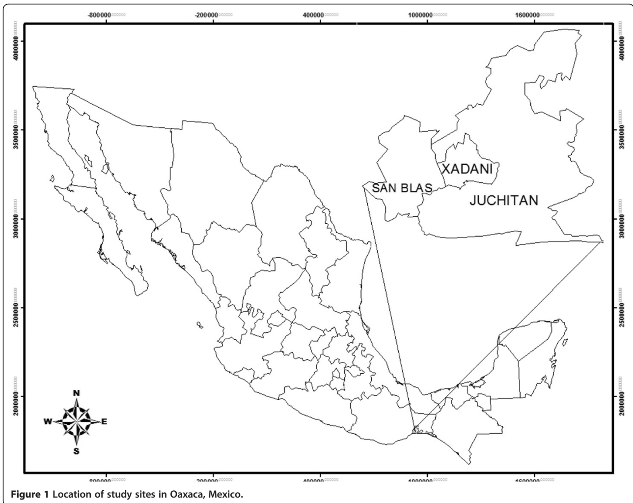
Figure 1 Location of study sites in Oaxaca, Mexico.

was 48.6 years old. We assumed that all interviewees may have had the same level of knowledge. All interviewees who participated in this study gave their previous informed consent to participate. Each of the 300 semi-structured interviews was conducted in Zapotec by the first author, a native Zapotec speaker. When the interviewees were not competent in Zapotec the interview was conducted in Spanish. We obtained the respondent's personal information including age, main occupational activity, number of