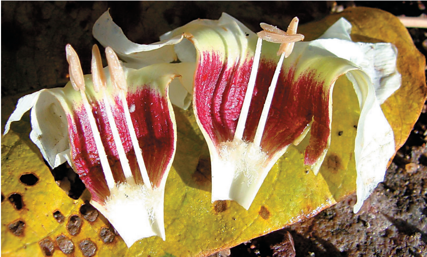
FIG. 3. Corollas of Ipomoea arborescens var. pachylutea in Sonora. The large and almost continuous areas of purple in the corolla throats are distinctive.