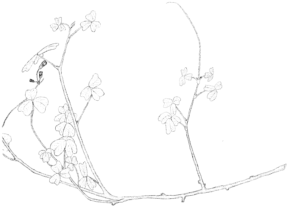
FIGURE 4. Oxalis spiralis ssp. vulvanicola (D. Sm.) Lourt. Habit ( \times\frac{1}{2} ). [After Nee 10001.]

This species occurs from Mexico to Venezuela and Colombia in humid and shadowed situations of the forest.