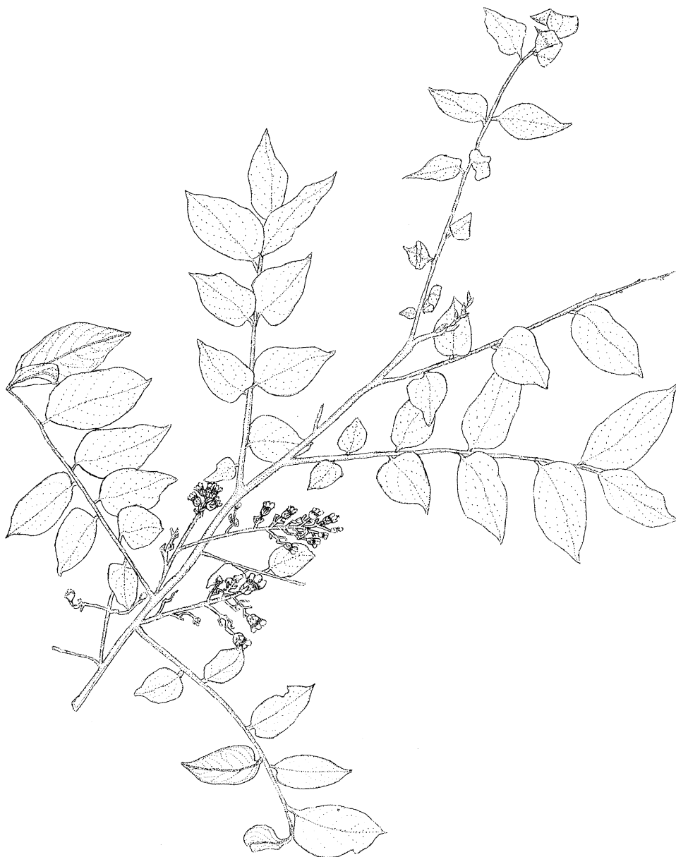
FIGURE 1. Averrhoa carambola L. Habit ( \times\frac{1}{2} ). [After Chi-en Chang 8567, Taiwan.]

Averrhoa bilimbi is a widespread tree in tropical regions. Frequent in the Orient, in America it is known only in botanical gardens and experiment stations.